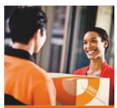
A single, standardised service level agreement for all plants, including emergency shipments.