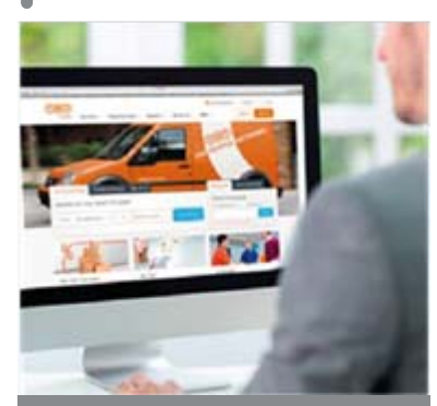
More than 4000 suppliers across Europe plus Israel, Morocco, Tunisia, Turkey and Ukraine.