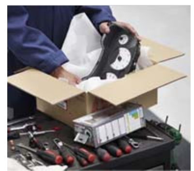
Missing parts must be collected from the supplier the same day and delivered early next morning.