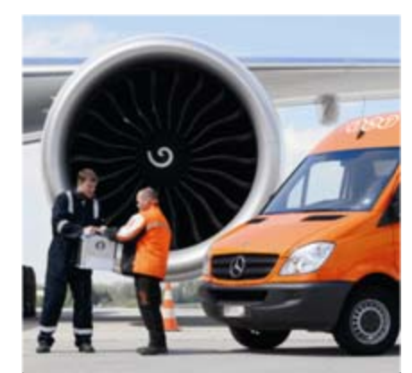
No internal divisions, we offer multiple modes of transport and the widest range of services via one contact