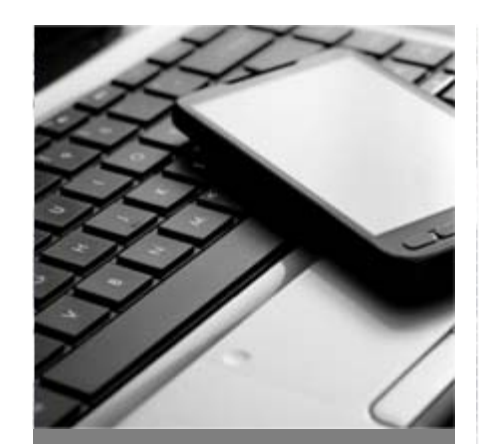
Competition is strong, product's shelf life is very short, new products should be launched swiftly to the market