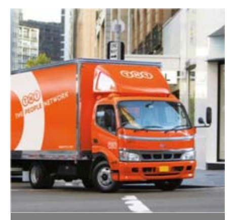
Customers require more frequent shipments in smaller quantities, and apply more delivery conditions - timed delivery, pedestrian areas, etc.