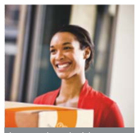
Lower threshold for priority customer status and use of the specialist desk