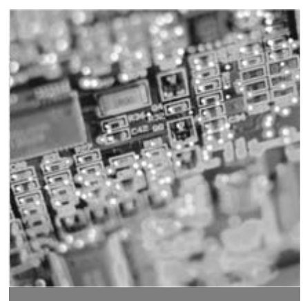
High value products are vulnerable to theft and damage