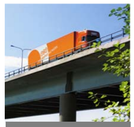
Industrial companies increasingly required to supply products directly from a central production or European distribution point to their channel partners to keep speed of distribution