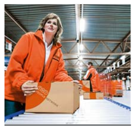
These teams are empower to perform service recovery at our cost and in-transit service upgrades, if necessary