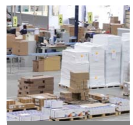
Multiple touch points in the delivery process are vulnerable to disruption with limited visibility and control over supply chain